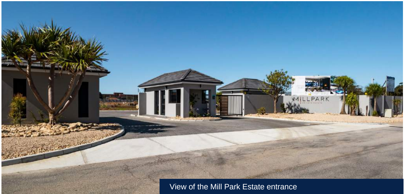
View of the Mill Park Estate entrance

The internal roads, perimeter walls, entrance guardhouse and civils are now complete. The site has water and electricity and the 2,2m boundary wall has eight strand electrified fencing which stretches roughly 685m with CCTV cameras at 37m intervals.