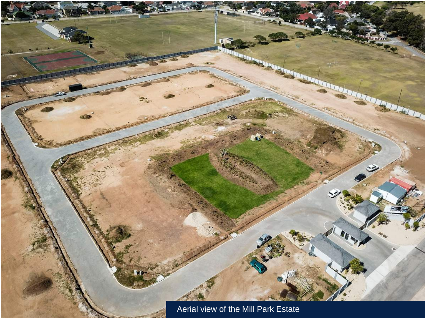
Aerial view of the Mill Park Estate

Even with the tough economic climate, INEX has persevered and continued to maintain a steady upward trend in terms of product development, staff retention and acquisition.