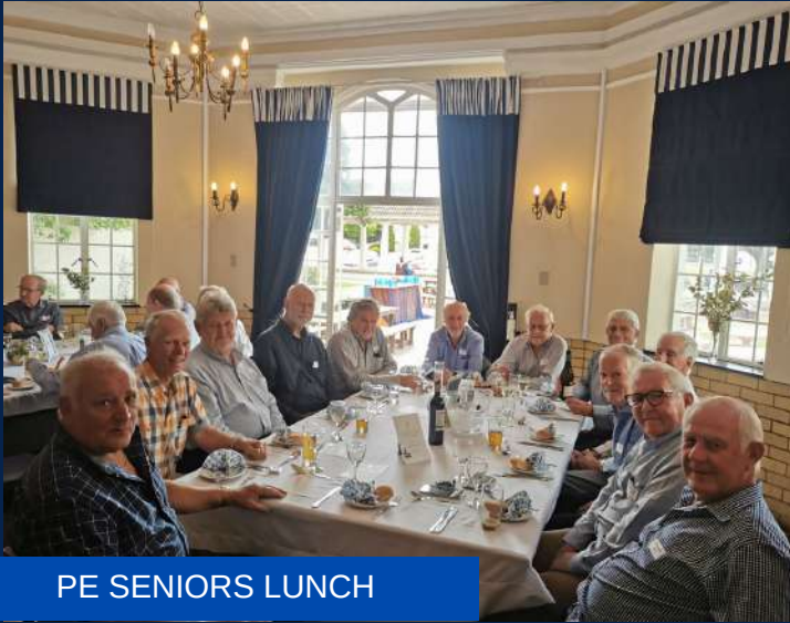
PE SENIORS LUNCH